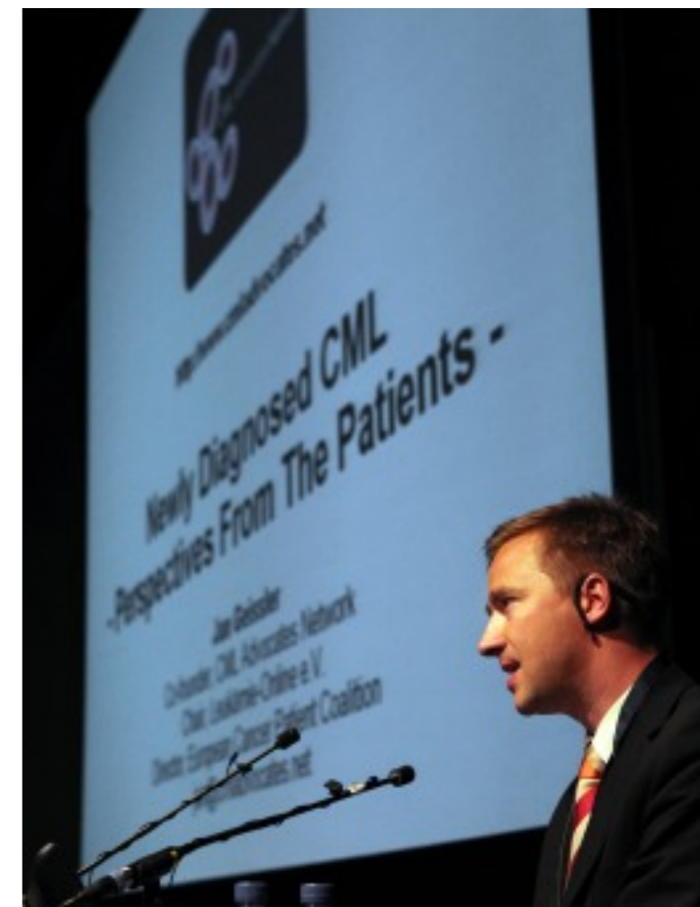
EHA Annual Conf2010, Barcelona Satellite Symposium "Evolving concepts in management of CML"