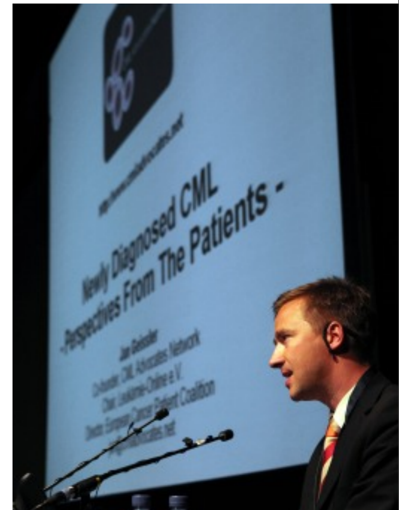
EHA Annual Conf2010, Barcelona Satellite Symposium "Evolving concepts in management of CML"